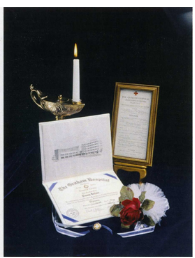
115 Years of Excellence

Graham Hospital School of Nursing will continuously achieve excellence in diploma nursing education.